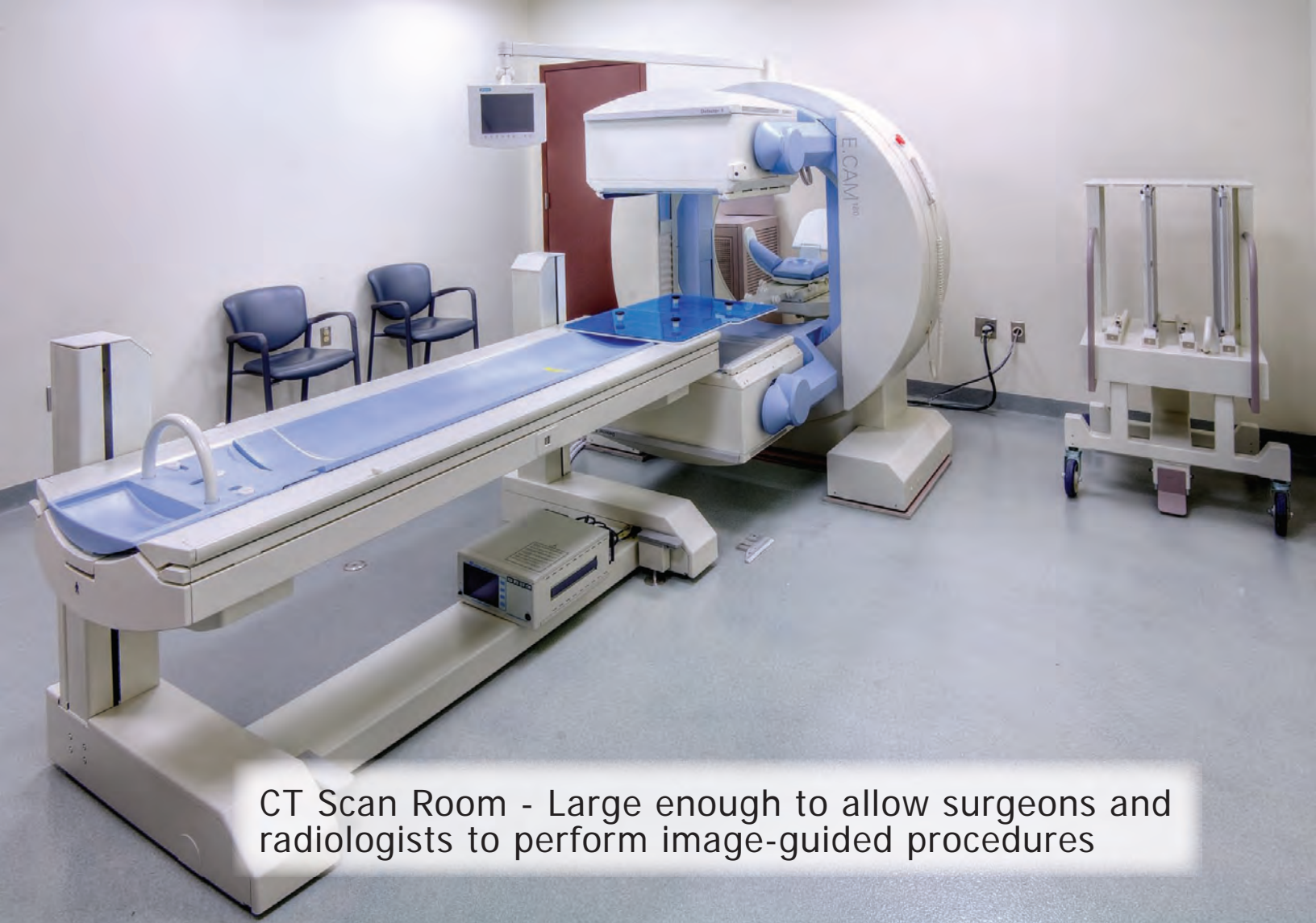
CT Scan Room - Large enough to allow surgeons and radiologists to perform image-guided procedures