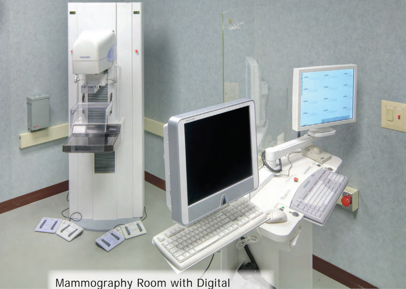
Mammography Room with Digital Mammography Unit